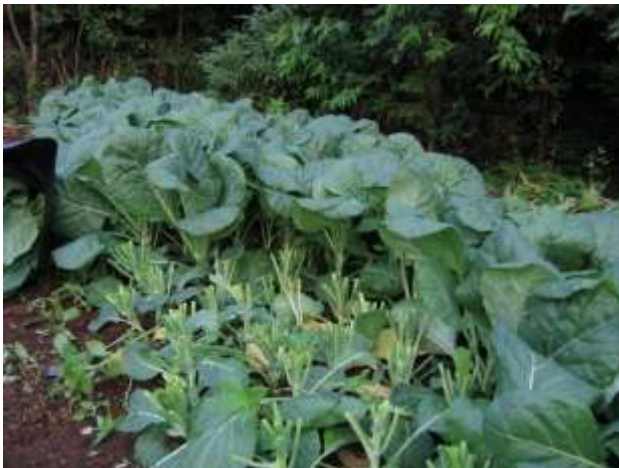
Bottom Left: Collard Greens