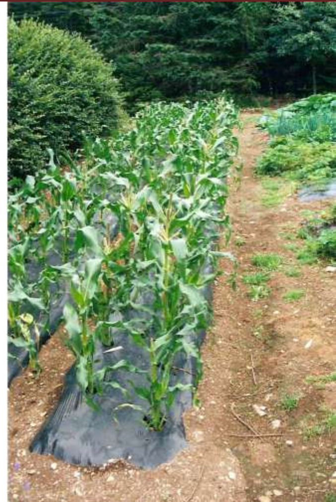
Right: Corn grown with plastic mulch